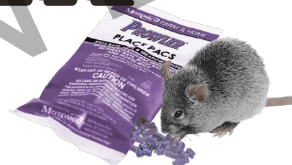
Photo may not be representative of a label-consistent bait placement