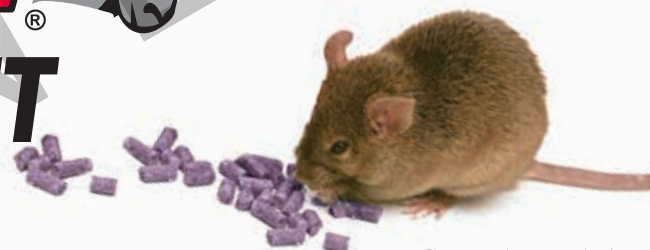
Photo may not be representative of a label-consistent bait placement

Due to Stop Feed Action, Rats and Mice Typically Feed Less or Cease Feeding Altogether After Consuming a Lethal Dose